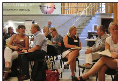
From our User Conference. Over 120 participants, users and clients!

is an active and working network for exchanging experiences and learning with the aim of increasing quality to end customers. Some meetings are free; others have an associated cost. You may also have your resume and a link to your business advertised on the Four Rooms' website. During the certification program, the membership fee for the User Forum is included. The price of membership in the User Forum is reasonable and includes at least one "national or international conference" per year. It also includes local and regional meetings arranged on the initiatives of other members. The spreading of the Four Rooms around the world provides opportunities for International perspectives, contacts, and collaboration.